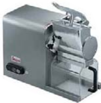
GF Hp 2