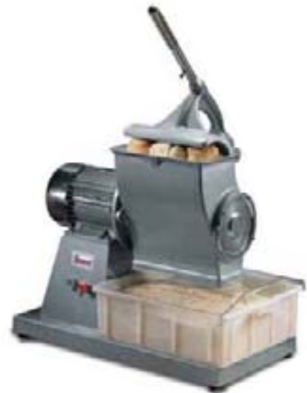
GF Hp 4